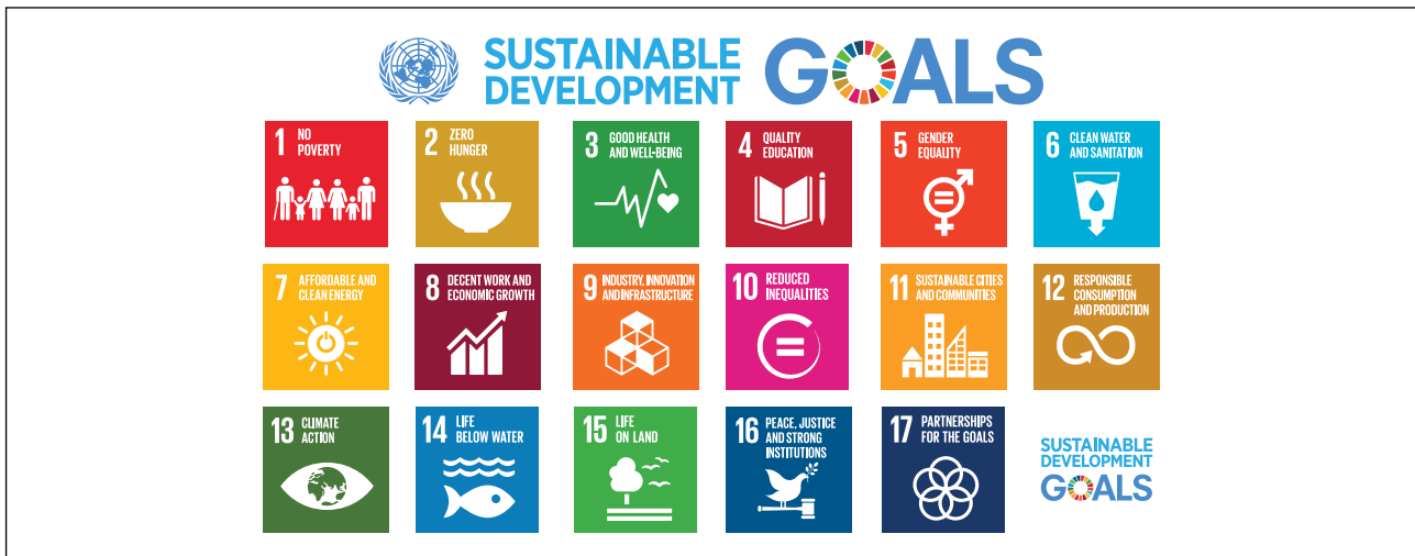
Source: United Nation Sustainable Development Goals (UNSDG) 17 goals

Board of Directors (“the Board”) is responsible for the Group’s sustainability agenda, practices, strategies and performance, supported by the Senior Management (“SM”), whose member’s compositions includes the Executive Chairman, the Chief Operation Officer (“COO”) and the Chief Financial Officer (“CFO”). The SM oversees the policies, initiatives, targets and the performance of the Group to ensure that the Group’s business is conducted in a sustainable manner.